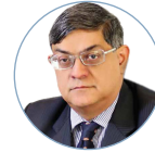
Gourab Banerji Senior Advocate, Supreme Court of India