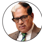
Justice A. K. Sikri Former Judge Supreme Court of India