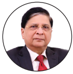
Justice Dipak Misra Former Chief Justice of India