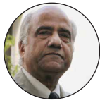
Justice B N Srikrishna Former Judge Supreme Court of India